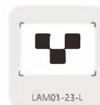
Sprinter LDW LAM01-23-L