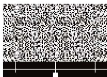
Subaru LDW LAM 01-25