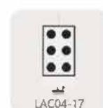
Honda-Lane Watch LAC04-17