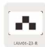
Sprinter LDW LAM01-23-R