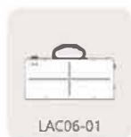
Audi, GM, VW (LAC06-01)