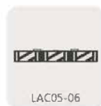
Audi, VW (LAC05-06)